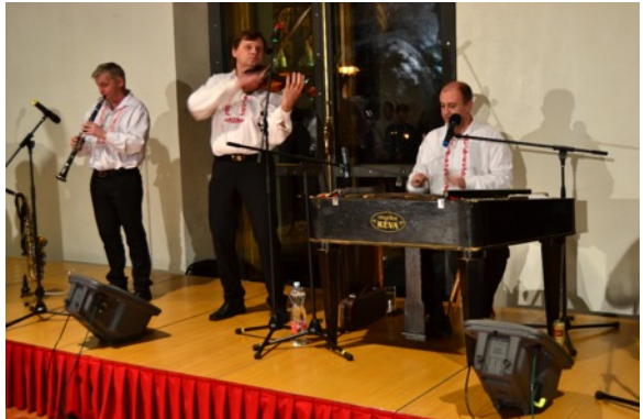
No conference dinner is complete without local music.

Eventually, the hard-core science program started with two wide and sobering talks by Hans Joachim Schellnhuber and Terry Callaghan on Tuesday morning. I spent the rest of the day following the program of session 4, Hemispheric and regional atmospheric impacts of a rapidly changing Arctic climate , where I also held a <u>teaser</u> and a <u>poster presentation on persistence in</u> <u>Arctic sea ice</u>.