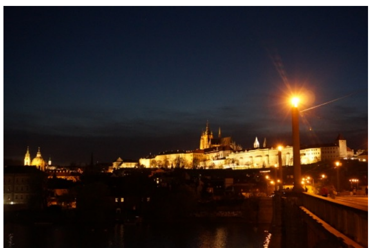
View of Prague Castle from the Charles Bridge.

The 19<sup>th</sup> annual Arctic Science Summit Week was organized March 31 – April 7, 2017 in Prague, Czech Republic. The conference is an initiative by the International Arctic Science Committee (IASC) in order to provide opportunities for coordination, cooperation and collaboration between various scientific organizations involved in Arctic research and to economize on travel and time. This year's program comprised of a business part March 30<sup>th</sup> – April 3<sup>rd</sup> and a scientific part April 4<sup>th</sup>–7<sup>th</sup>, including an Association of Polar Early Career Scientists (APECS) workshop April 2<sup>nd</sup>, social scientific program April 3<sup>rd</sup> and a <u>Multidisciplinary drifting Observatory for the Study of Arctic Climate (MOSAiC)</u> workshop April 4<sup>th</sup>–5<sup>th</sup>).