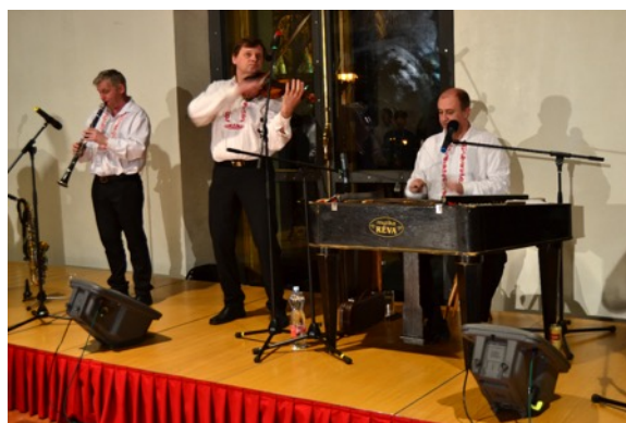
No conference dinner is complete without local music.