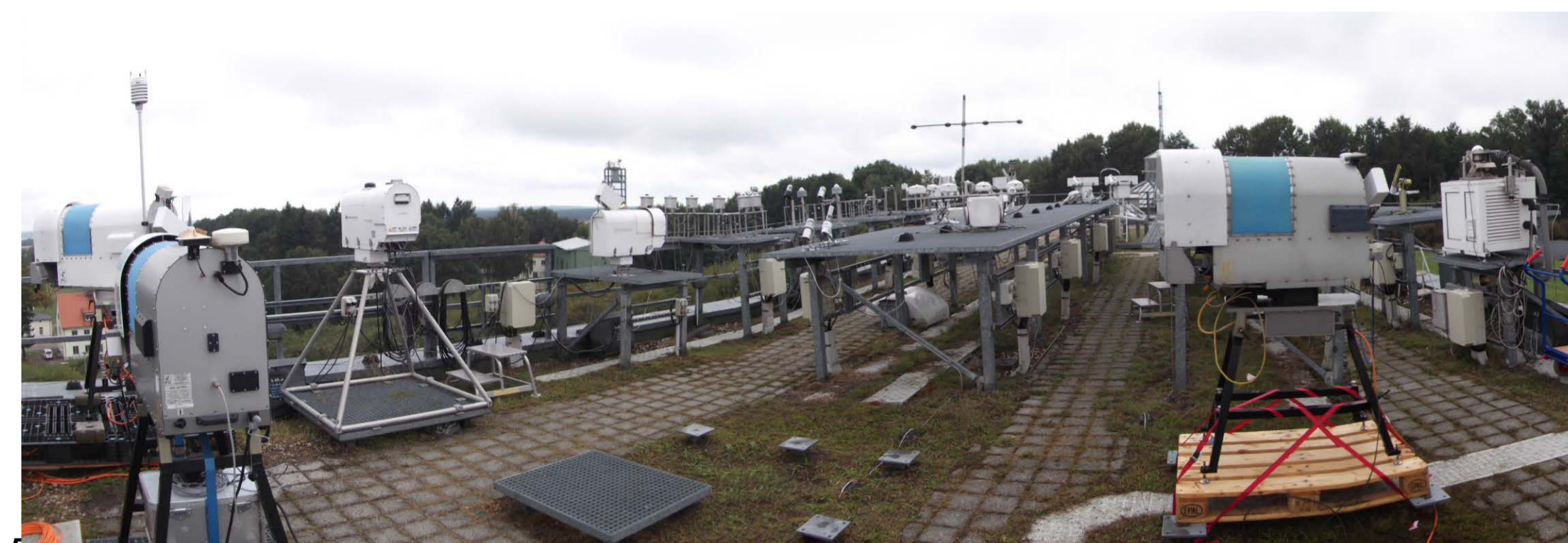
Fig. 1: Overview of MWR intercomparison campaign in the frame of TOPROF at LWZ in Lindenberg

Ground-based microwave radiometers (MWR) are already widely used by national weather services and research institutions all around the world. Most of the instruments operate continuously and are beginning to be implemented into data assimilation for atmospheric models. Especially their potential for continuously observing boundary-layer temperature profiles as well as integrated water vapor and cloud liquid water path makes them valuable for improving short-term weather forecasts.