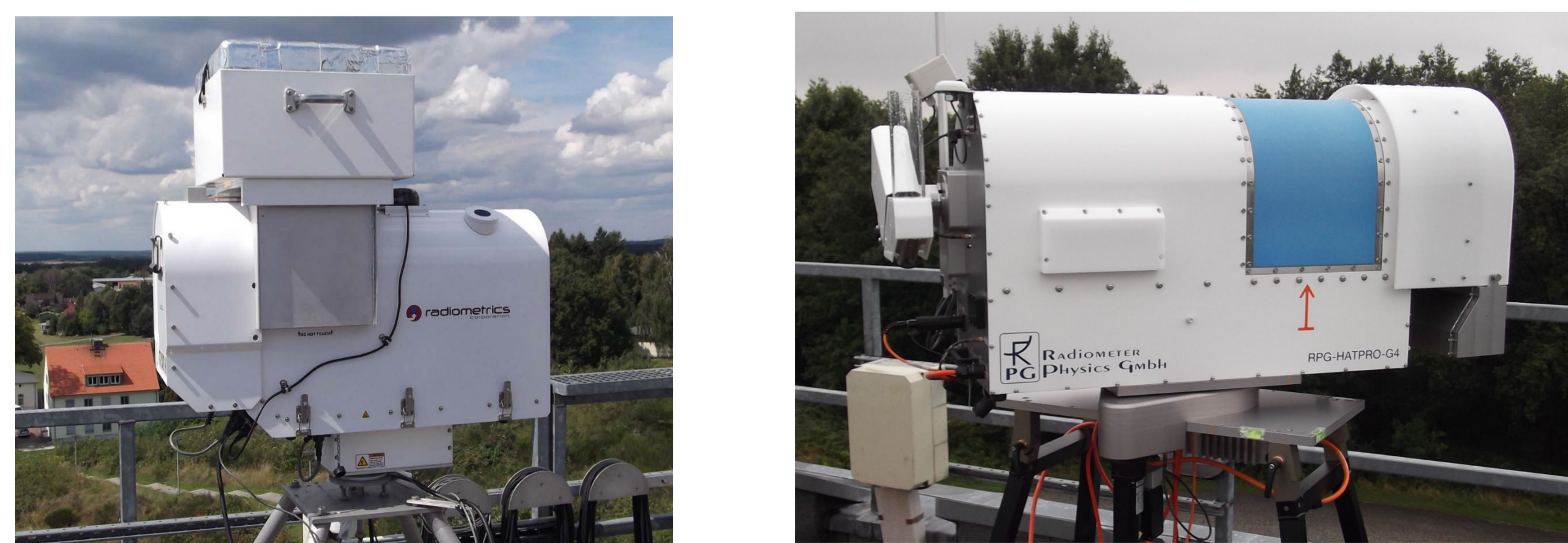
Fig. 2: left: MP-3000 Profiler, right: HATPRO-G4 radiometer, both during the TOPROF campaign in Lindenberg

Some technical differences between the two systems require separate user recommendations for operation and calibration.