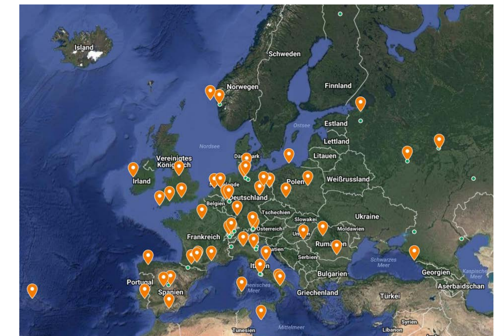
Fig. 4: Stations with current or past MWR measurements

The increasing number of MWR observations makes it possible to perform data assimilation studies or similar coordinated tasks. Caumont et al., 2016 and De Angelis et al., 2017 show that there is potential to improve boundary-layer thermodynamic profiles in models by assimilating MWR data into models. On Fig. 4, the network of current and past MWR stations in Europe shows a rather good distribution. Details can be found at http://cetemps.aquila.infn.it/mwrnet/