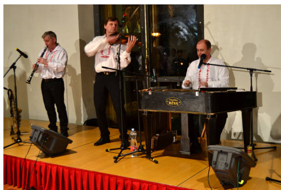
No conference dinner is complete without local music.