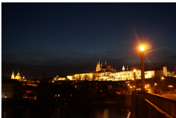
View of Prague Castle from the Charles Bridge.

The 19 th annual Arctic Science Summit Week was organized March 31 – April 7, 2017 in Prague, Czech Republic. The conference is an initiative by the International Arctic Science Committee (IASC) in order to provide opportunities for coordination, cooperation and collaboration between various scientific organizations involved in Arctic research and to economize on travel and time. This year's program comprised of a business part March 30 th – April 3 rd and a scientific part April 4 th –7 th , including an Association of Polar Early Career Scientists (APECS) workshop April 2 nd , social scientific program April 3 rd and a Multidisciplinary drifting Observatory for the Study of Arctic Climate (MOSAIC) workshop April 4 th –5 th ).